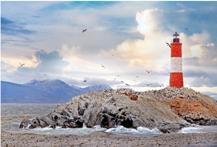
Les Eclaireurs lighthouse, Tierra del Fuego, Argentina

The Boujdour lighthouse was originally constructed in 1953 and was first lit 6 years later. The tower stands at 171 feet tall and became a historical monument in Morocco in 1976.