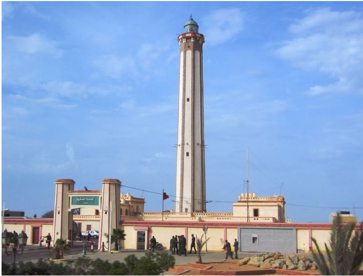
Boujdour Lighthouse, Cape Bojador, Boujdour, Morocco

The two main purposes of a Lighthouse are to serve as a navigational aid and to warn ships (Investors) of dangerous areas. It is like a traffic sign on the sea.